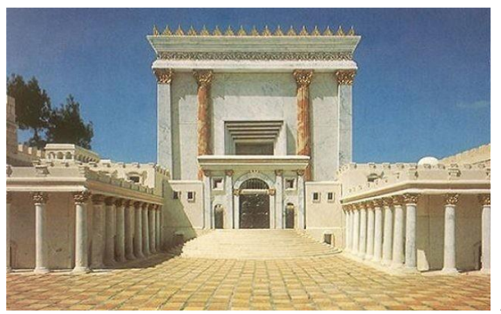
Model of the Second Temple

When some of those in exile returned during the reign of the Persians, the degree to which the Jews looked upon the Persian King Cyrus the Great (600-530BC) as their benefactor and a servant of their God is reflected at several points in the Bible, eg Isaiah 45:1-3, where he is actually called God's anointed.