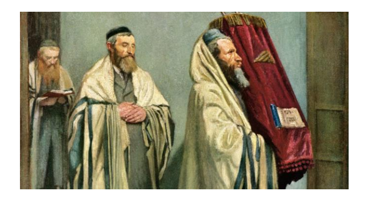
Traditional view of Ezra in the new temple

Ezra's narrative reveals two main issues faced by the returning exiles: (1) the struggle to restore the temple (Ezra 1:1-6:22) and (2) the need for spiritual reform (7:1-10:44). Both were necessary in order for the people to renew their fellowship with the Lord.